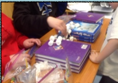
FAMILIES BUILDING BRIDGES