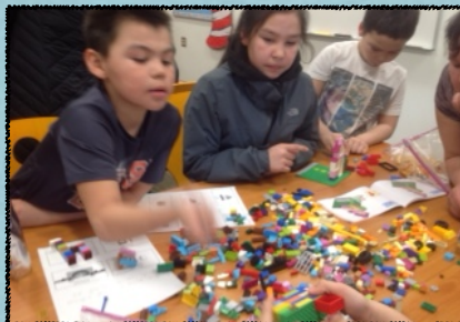
FAMILIES WORKING TOGETHER TO CREATE LEGO OBJECTS.