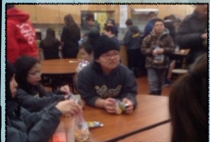
Families enjoying Migrant Ed Family Night!.